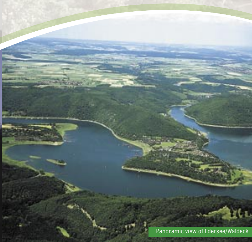
Panoramic view of Edersee/Waldeck