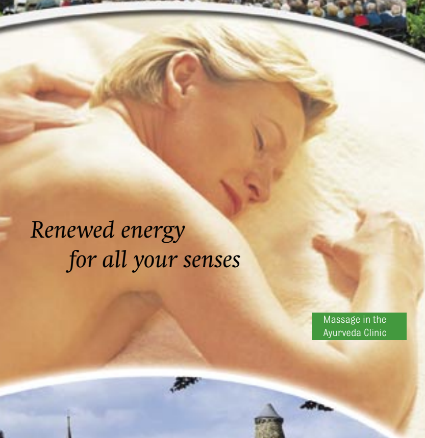
Massage in the Ayurveda Clinic