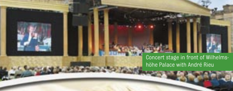
Concert stage in front of Wilhelmshöhe Palace with André Rieu